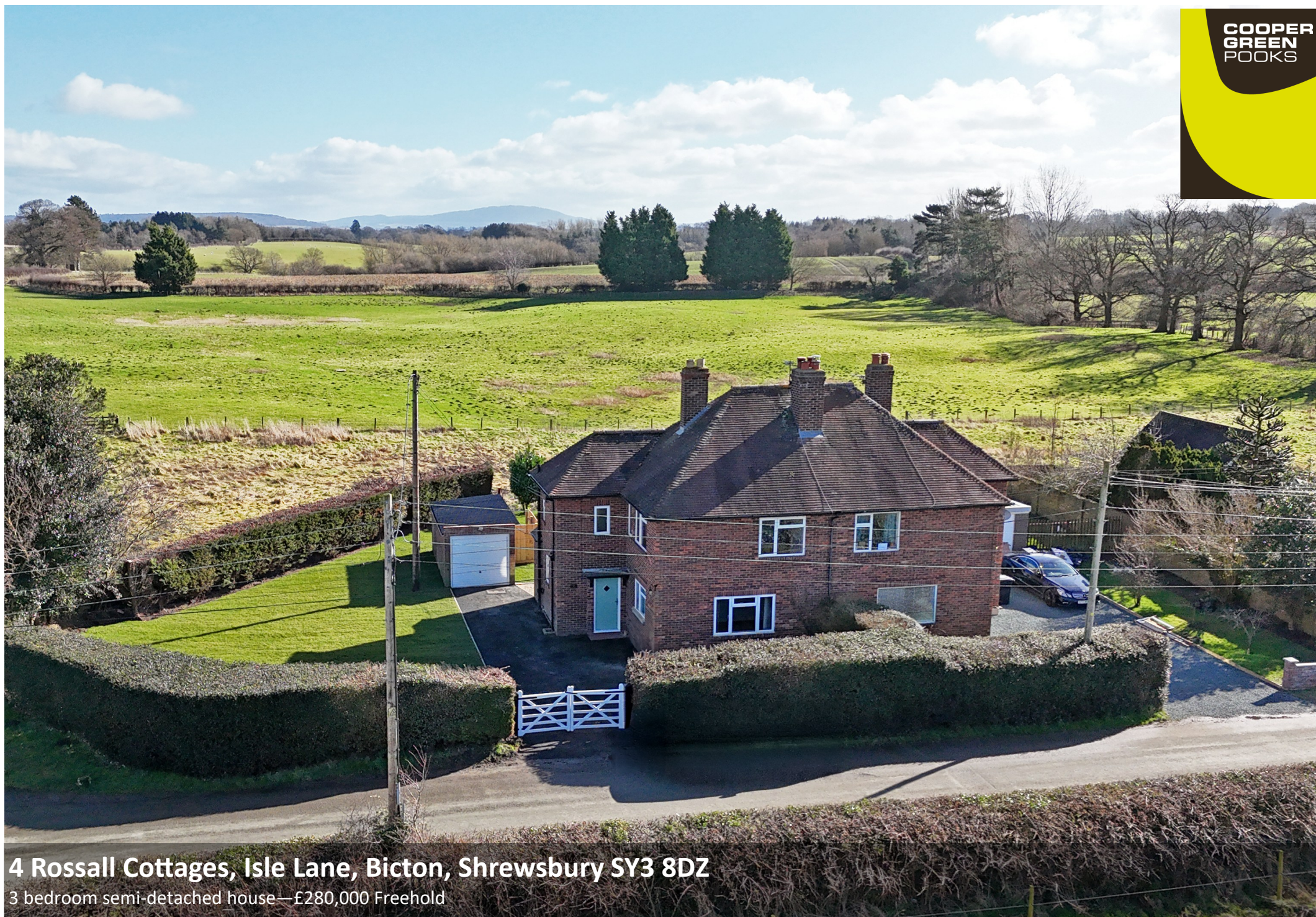
4 Rossall Cottages, Isle Lane, Bicton, Shrewsbury SY3 8DZ

3 bedroom semi-detached house—£280,000 Freehold